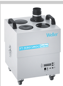
Fume extraction devices