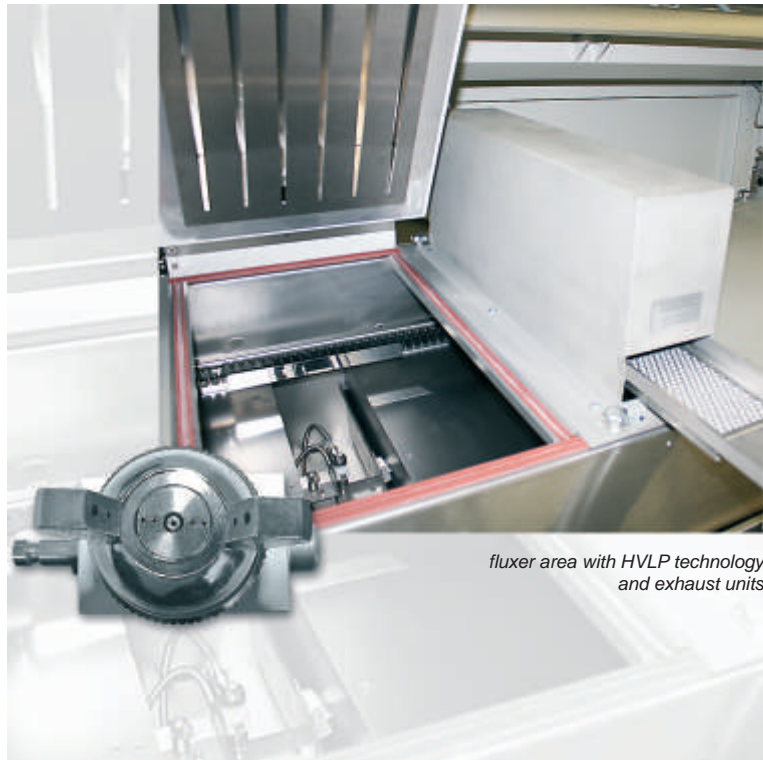
fluxer area with HVLV technology and exhaust units

This is accomplished with the innovative tunnel concept, individually in speed controllable conveyor segments, the reproducible flux application, the modular preheat configuration and the up-to-date soldering area which leaves nothing to be desired.