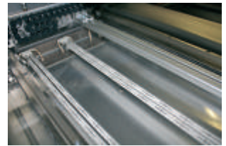
quartz preheat zone