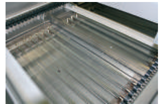
infrared preheat zone