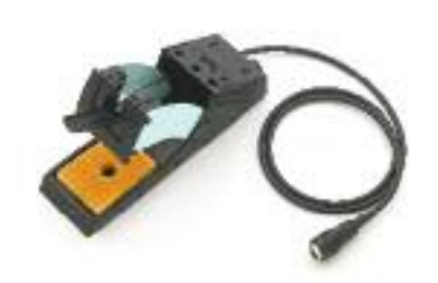
Safety rest for WMP Micro soldering pencil with Stop + Go function