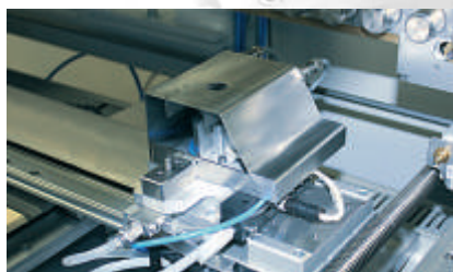
real quantity control for drop jet fluxers

Every taught solder point can be displayed simultaneous to the soldering process, captured with the real-time camera. Any adjustment of parameters which might be necessary to improve the process can be done immediately to ensure that the following incoming printed circuit board already will be soldered with perfect results.