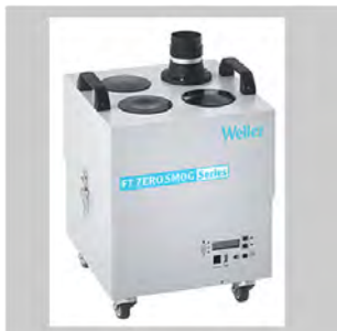
Solder fume extractors