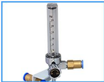
❖ Nitrogen valve (Model: HN2-01)

Effective usage of N 2 combined with Super Dry, help to accelerate the recovery time and oxidation prevention. Set the buttons on N 2 purge system itself