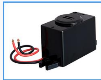
❖ Humidity/ Door open alarm buzzer

Suitable for storage of components on tape and reel, can pull out on rail