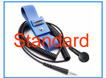
❖ Wrist strap connection

Allows grounding while handling ESD sensitive materials