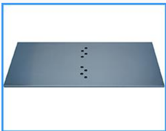
❖ Extra shelf

Greatly increase the usable space inside Super Dry