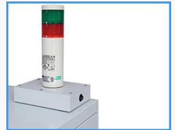
❖ Humidity alarm light

Alarm buzzer sounds when its internal humidity/ door open time exceeds set value