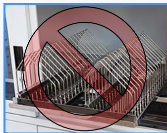
❖ SMD double rack (stainless steel)

Suitable for storage of components on tape and reel, can pull out on rail