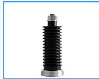
❖ Adjustable legs