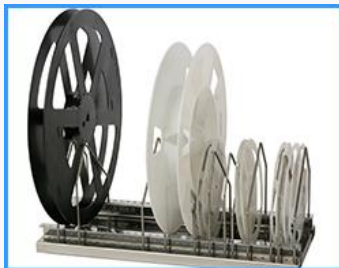
❖ SMD single rack (stainless steel)

Greatly increase the usable space inside Super Dry