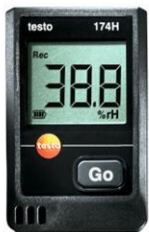
❖ Data logger with software (model Testo 174H)

Allows grounding while handling ESD sensitive materials