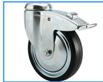
❖ Castors(4 pcs)

Simple N 2 flow meter 0-25L/min adjustable