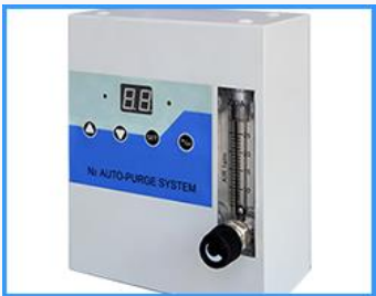
❖ Independent Nitrogen purge system (Model TN2-02)

Alarm light flashes and sounds when its internal humidity exceeds set value