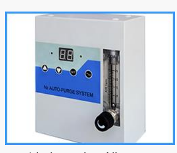
❖Independent Nitrogen purge system (Model TN2-02)

Alarm light flashes and sounds when its internal humidity exceeds set value