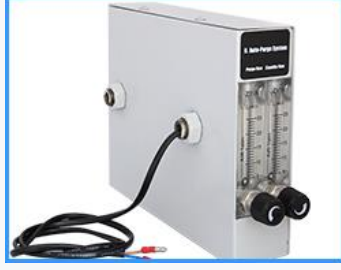
Nitrogen auto purge system (Model AN2-03)

Simple N<sub>2</sub> flow meter 0-25L/min adjustable