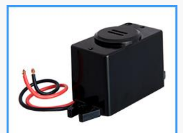
Humidity/ Door open alarm buzzer

Suitable for storage of components on tape and reel, can pull out on rail