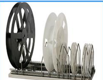
❖SMD single rack (stainless steel)

Greatly increase the usable space inside Super Dry