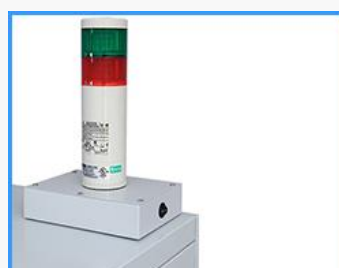
Humidity alarm light

when its internal humidity/ door open time exceeds set value