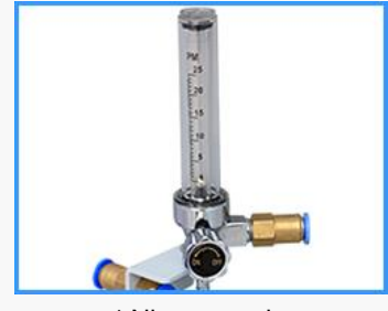
❖Nitrogen valve (Model: HN2-01)

Effective usage of N<sub>2</sub> combined with Super Dry, help to accelerate the recovery time and oxidation prevention. Set the buttons on N2 purge system itself