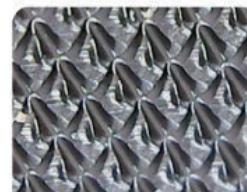
Sharp edge of teeth

Burr on each file tooth is eliminated before black coating, good for high and lasting performance of filing.