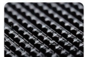
Rust-resistant black coating