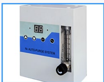
❖ Independent Nitrogen purge system (Model TN2-02)

Alarm light flashes and sounds when its internal humidity exceeds set value