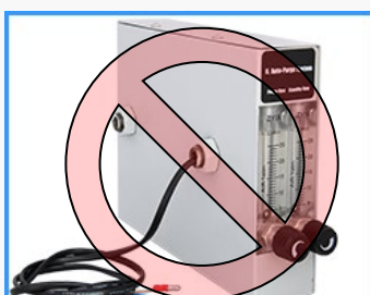
❖ Nitrogen auto purge system (Model AN2-03)

Simple N 2 flow meter 0-25L/min adjustable