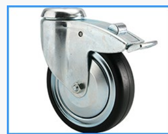
❖ Castors(4 pcs)

Data logging humidity and temperature, can read and output data by software with a PC