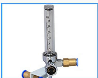
❖ Nitrogen valve (Model: HN2-01)

Effective usage of N 2 combined with Super Dry, help to accelerate the recovery time and oxidation prevention. Set the buttons on N 2 purge system itself