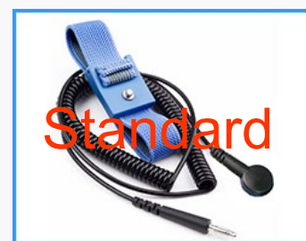
❖ Wrist strap connection

Allows grounding while handling ESD sensitive materials