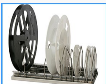
❖ SMD single rack (stainless steel)

Greatly increase the usable space inside Super Dry