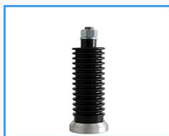
❖ Adjustable legs

Effective usage of N 2 combined with Super Dry, help to accelerate the recovery time and oxidation prevention. Set on digital control panel