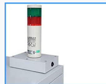
❖ Humidity alarm light

Alarm buzzer sounds when its internal humidity/ door open time exceeds set value