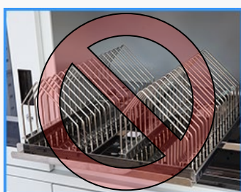
❖ SMD double rack (stainless steel)

Suitable for storage of components on tape and reel, can pull out on rail