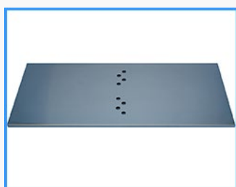
❖ Extra shelf

Greatly increase the usable space inside Super Dry