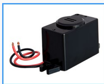
❖ Humidity/ Door open alarm buzzer

Suitable for storage of components on tape and reel, can pull out on rail