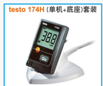
❖ Data logger with software (model 174H)

Allows grounding while handling ESD sensitive materials