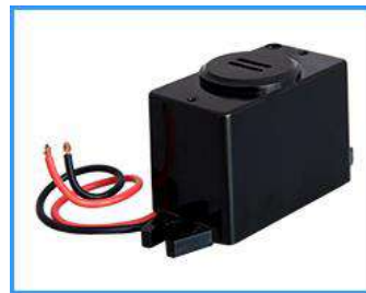
❖ Humidity/ Door open alarm buzzer

Suitable for storage of components on tape and reel, can pull out on rail