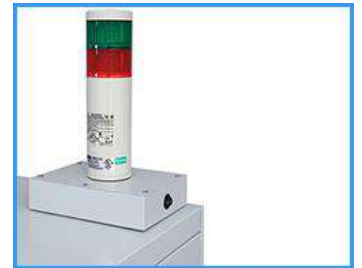
❖ Humidity alarm light

Alarm buzzer sounds when its internal humidity/ door open time exceeds set value