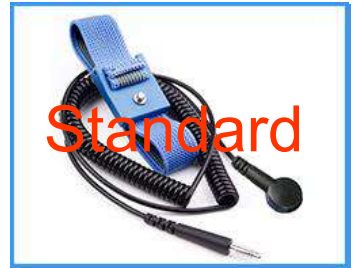
❖ Wrist strap connection

Allows grounding while handling ESD sensitive materials