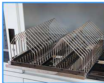
❖ SMD double rack (stainless steel)

Suitable for storage of components on tape and reel, can pull out on rail