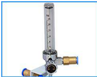
❖ Nitrogen valve (Model: HN2-01)

Effective usage of N 2 combined with Super Dry, help to accelerate the recovery time and oxidation prevention. Set the buttons on N 2 purge system itself