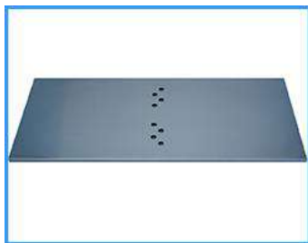
❖ Extra shelf

Greatly increase the usable space inside Super Dry