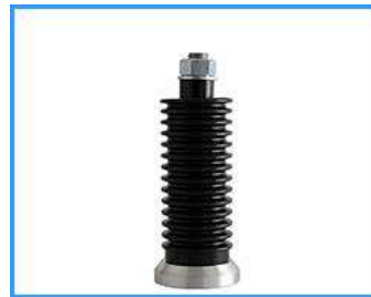
❖ Adjustable legs

Effective usage of N 2 combined with Super Dry, help to accelerate the recovery time and oxidation prevention. Set on digital control panel