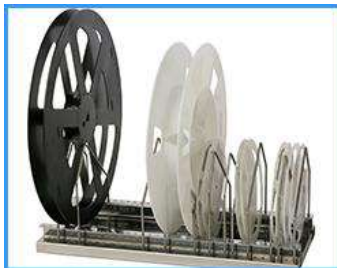
❖ SMD single rack (stainless steel)

Greatly increase the usable space inside Super Dry