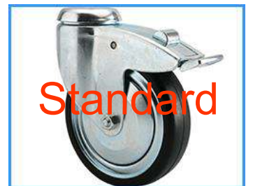
❖ Castors(4 pcs)

Record the humidity and temperature data of dry cabinet; data can be output from PC