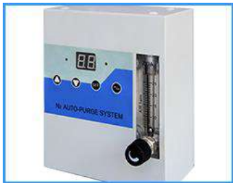
❖ Independent Nitrogen purge system (Model TN2-02)

Alarm light flashes and sounds when its internal humidity exceeds set value