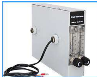
❖ Nitrogen auto purge system (Model AN2-03)

Simple N 2 flow meter 0-25L/min adjustable